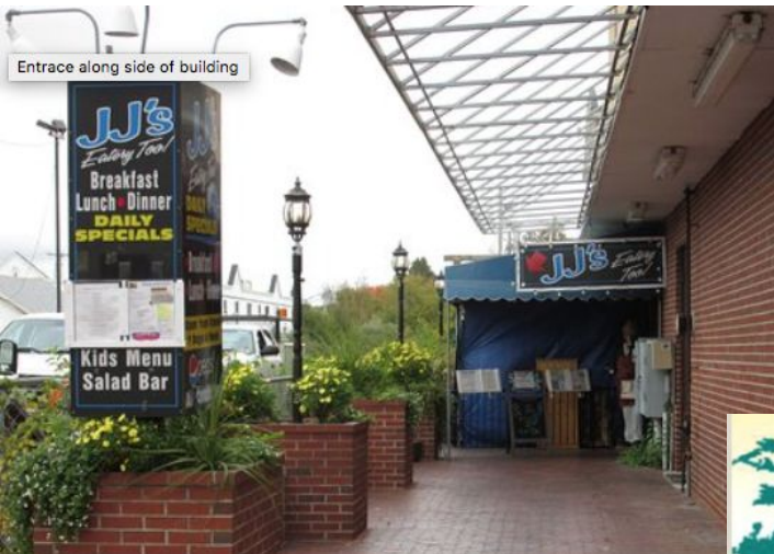
JJ's Eatery Too!