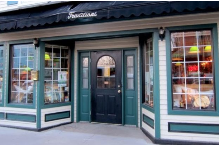
Traditions Italian Ristorante