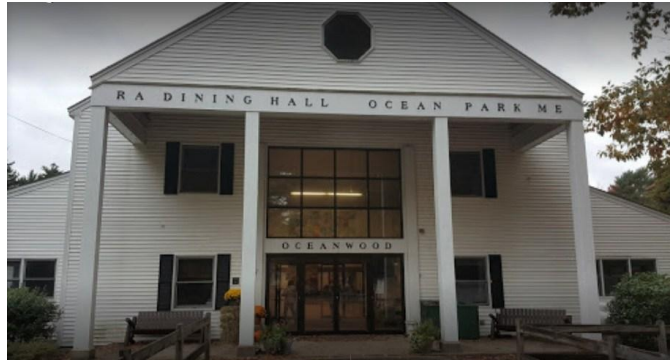
Oceanwood Camp & Conference Center